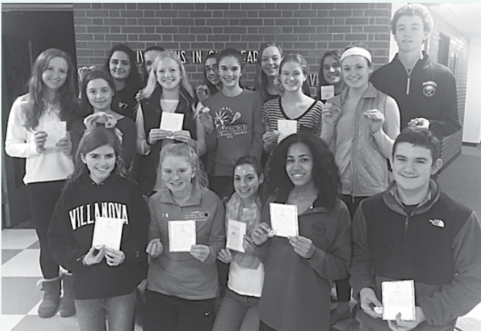
Youth Auxiliary Board members show their hand painted support stones.

Francis House's symposium, Living the Final Chapter: Compassionate Care for Persons at End of Life was preceded by An Unforgettable Evening with Scott Simon. Over 100 guests gathered at Le Moyne College to hear the remarks of Scott Simon, best known as the award-winning host of Weekend Edition Saturday on NPR. Mr. Simon shared stories recounted in his book Unforgettable. The book chronicles his time with his mother in her hospital room during the last weeks of her life in July 2013. It was a special night filled with laughter and tears.